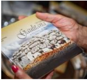
Gaulitana – A festival