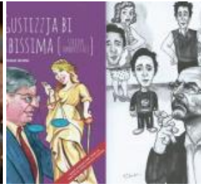
When a smile solves it all