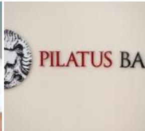
Company accused of role in €3